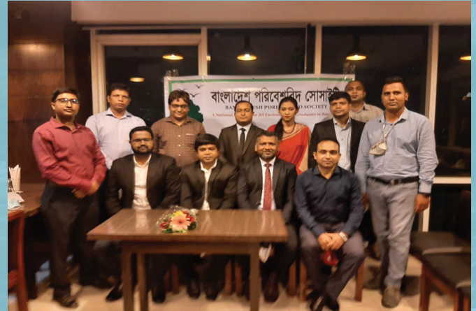
Present Executive Committee Members of Bangladesh Poribeshbid Society